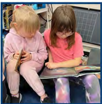
Pink Shirt Day and Buddy Class Activities.