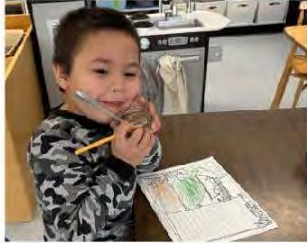
SEEDS & SNACKS