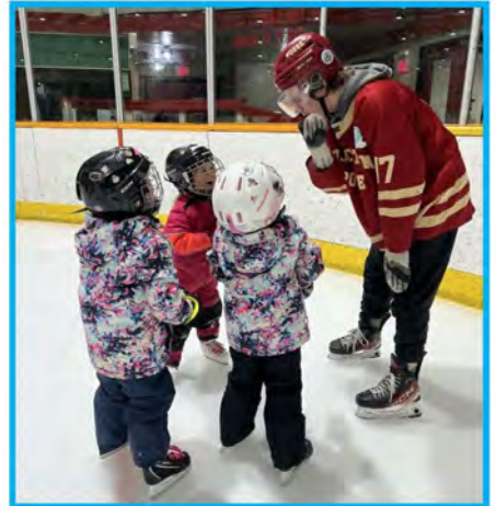
Our JAE PAC has purchased skates and helmets to support our skating program. Each year, they also ensure each kiddo has the correct size.