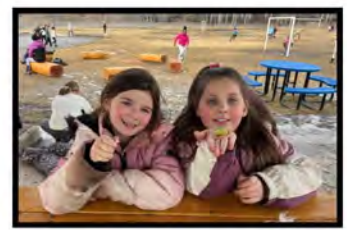
Kids who play outside grow in their character development; they become more adventurous, more self-motivated, and they are better able to understand & assess risk. K Fox